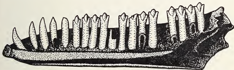
Fig. 2. Lingual view of the dentary of Leiocephalus apertosulcus ; type specimen.

Diagnosis . Leiocephalus apertosulcus differs from all other species in the genus, both living and extinct, in having Meckel's canal exposed as a deep groove along the lingual face of the dentary; in all other forms it is a tubular cavity completely surrounded by bone. The maximum snout-vent length of this species was at least 150 mm and possibly as great as 200 mm. This exceeds the maximum length attained by any living species (130 mm) and is equaled only by the extinct Barbudan species Leiocephalus cuneus .